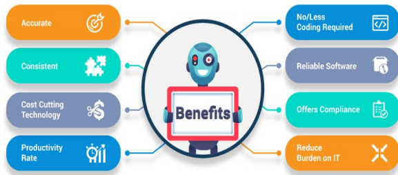
Fig 1-What are the benefits of the RPA [23]

"Industry 4.0" technology. The robots are responsible for the majority of the work that is done on the assembly lines.